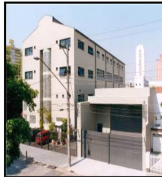
São Paulo Headquarter 2.200 sqm of built area.

This highlight position happens because there is constant investment in formation, development and upgrading of a staff highly qualified able to capture the sector innovation and presents to customer several correct solutions in many kind of events.